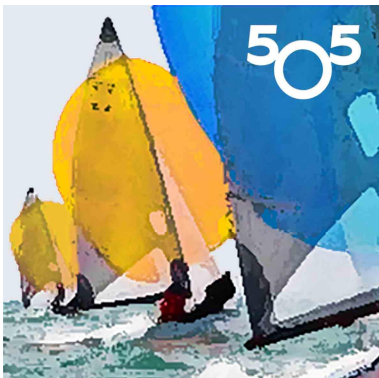
NO EMISSION RACE Swedish Nationals & Nordic Open Championships GÄVLE 8-10 JULY 2022